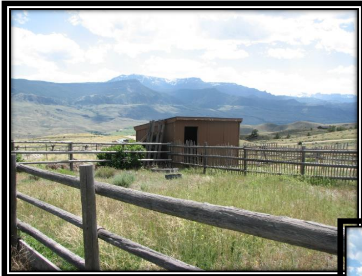
Shed and Corrals