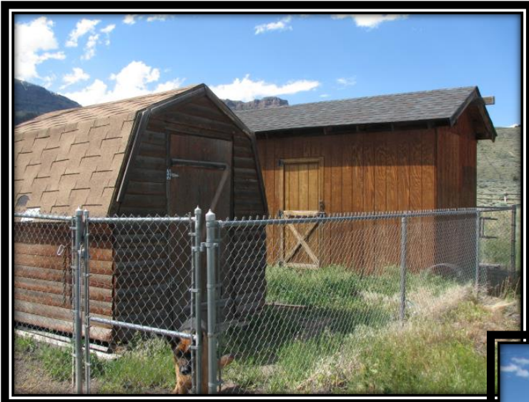
Storage Sheds (Included)