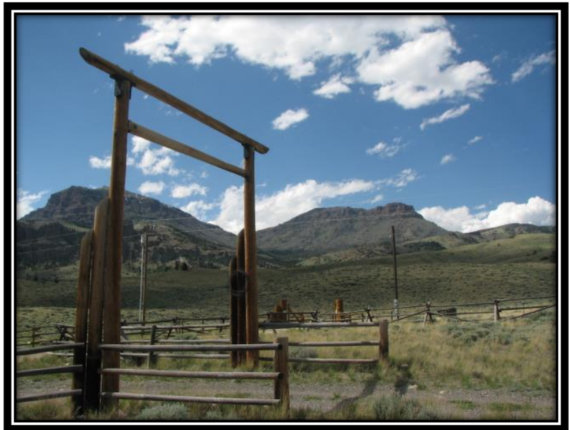
Beautiful Mountain Views