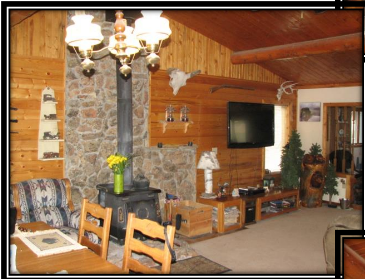
Great Room With Wood Stove