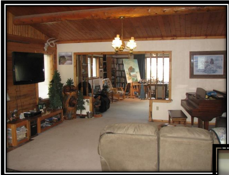
Great Room Looking into Family Room