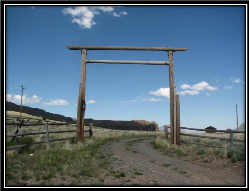
Entrance To Property