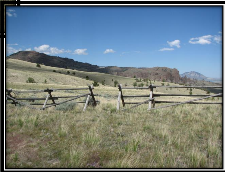
BLM Access from Back Yard