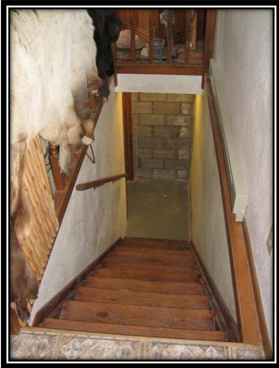
Stairway to Basement