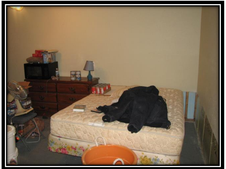
Room in Basement